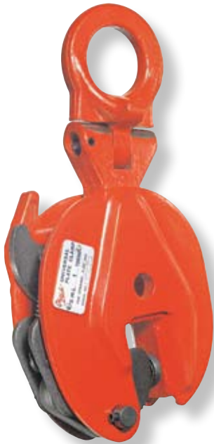
Plate Lifting Clamps